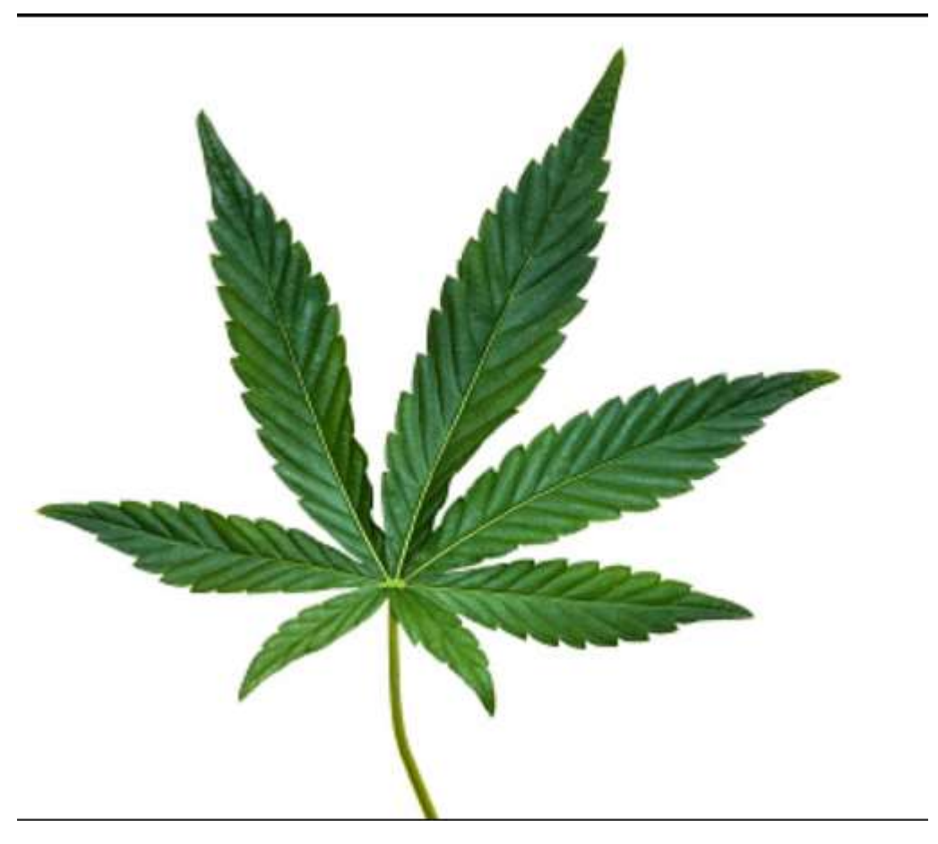
Leaves of cannabis