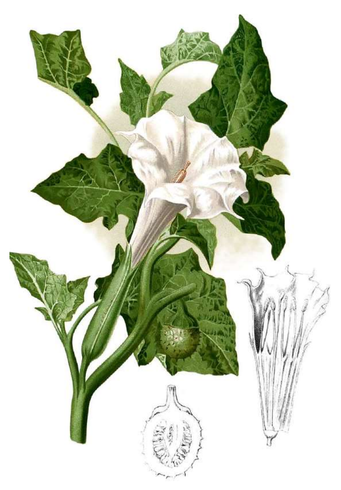
Flowering branch of Datura