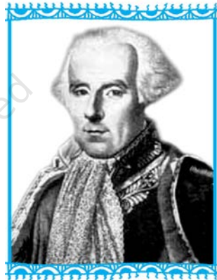
P.S. Laplace (1749-1827)

\frac{a_1}{a_2} \neq \frac{b_1}{b_2} or, a_1 b_2 - a_2 b_1 \neq 0 , then the system of linear equations has a unique solution). The number a_1 b_2 - a_2 b_1