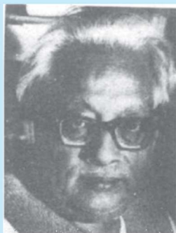
Satyendranath Bose (1894-1974)

Satyendranath Bose, born in Calcutta in 1894, is among the great Indian physicists who made a fundamental contribution to the advance of science in the twentieth century. An outstanding student throughout, Bose started his career in 1916 as a lecturer in physics in Calcutta University; five years later he joined Dacca University. Here in 1924, in a brilliant flash of insight, Bose gave a new derivation of Planck's law, treating radiation as a gas of photons and employing new statistical methods of counting of photon states. He wrote a short paper on the subject and sent it to Einstein who immediately recognised its great significance, translated it in German and forwarded it for publication. Einstein then applied the same method to a