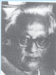
Satyendranath Bose (1894-1974)

Satyendranath Bose, born in Calcutta in 1894, is among the great Indian physicists who made a fundamental contribution to the advance of science in the twentieth century. An outstanding student throughout, Bose started his career in 1916 as a lecturer in physics in Calcutta University; five years later he joined Dacca University. Here in 1924, in a brilliant flash of insight, Bose gave a new derivation of Planck's law, treating radiation as a gas of photons and employing new statistical methods of counting of photon states. He wrote a short paper on the subject and sent it to Einstein who immediately recognised its great significance, translated it in German and forwarded it for publication. Einstein then applied the same method to a