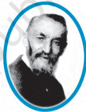
G. Peano (1858-1932)

In contrast to deduction, inductive reasoning depends on working with each case, and developing a conjecture by observing incidences till we have observed each and every case. It is frequently used in mathematics and is a key aspect of scientific reasoning, where collecting and analysing data is the norm. Thus, in simple language, we can say the word induction means the generalisation from particular cases or facts.