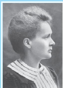
MARIE SKŁODOWSKA CURIE (1867-1934)

Radioactive elements (e.g., tritium, plutonium) which are short-lived i.e., have half-lives much less than the age of the universe ( \sim 15 billion years) have obviously decayed long ago and are not found in nature. They can, however, be produced artificially in nuclear reactions.